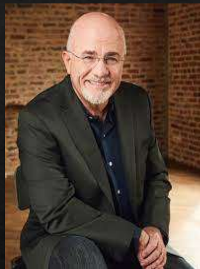
Dave Ramsey, American radio personality, vice chair